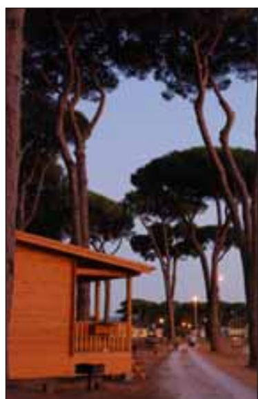
Camp Darby log cabins and campgrounds are tucked under umbrella pine trees that bring Mediterranean cool breezes.

Customers should make reservations at least two working days prior to drop-off at Outdoor Recreation by calling 633-7589 or off post 050-54-7589.